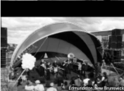
Edmands, New Brunswick