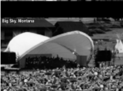
Big Sky, Montana